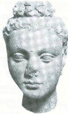
Figure 4 Budha in Gandhara

But it is needed to conduct more investigation about the traces of these people, the deities worshipped and accepted by the local people. They had religious relations with them when the Parthian had exiled them. With the passage of time, the same people became partners in commerce (Figure 4) and trade in the Kushana period.