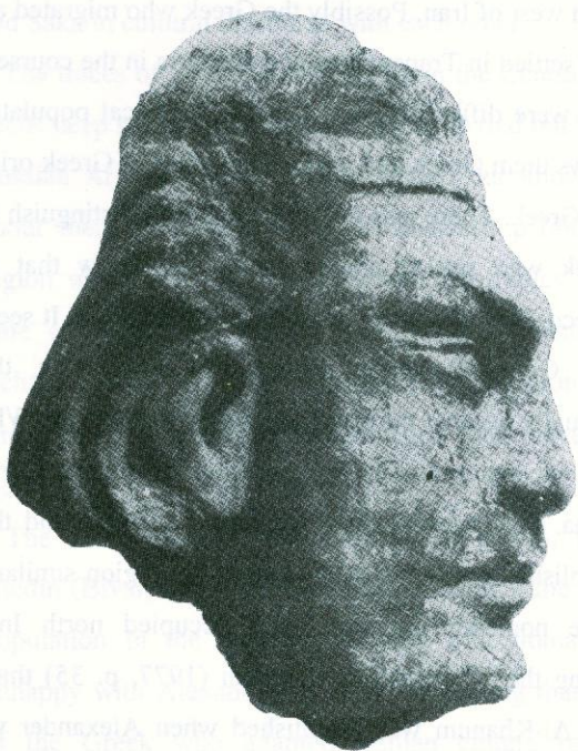
Figure 2 Obverse of silver coins maois (Kushana king)

Many Indian scholars maintain that the Romans were in touch with Kushana through the sea routes, and due to religious and social affairs of traders they had issued coins with Roman deities and Roman king. This motion seems to be unacceptable. The Roman deities must have been part of the religious life and naturally traders must