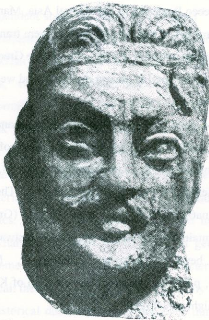
Figure 3 Two Kalachyan sculpture (Kushana period)