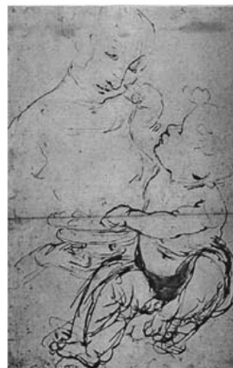
Figure 11 Leonardo Da Vinci: A part of da Vinci's drawing (relationship among the figures) The work is Typical of the Florentine Quattrocento and sir Kenneth Clark dates it a Dish of Fruit to the Child (pen, 330 x 250mm) Paris, Louvre.

Among Leonardo da Vinci's creations in addition to the wall painting of " The Last Supper ", in which the relationship among the Apostles is portrayed another is oil painting, " Virgin of the Rocks " (1485/ 890 A.H.) (Figure 12), containing the same features. The delicate relationship among the mother, the child and other characters is obviously felt. The pyramidal composition and the people's gathering in one place as well as their relationship, the omission of circumference lines and the use of fades are all characteristics of Leonardo da Vinci. "This is Leonardo's famous invention which the Italians call " sfumato "- the blurred outline and mellowed colours that allow one form to merge with another and always leave something to our imagination 15 ." In this painting, there is nothing viewed of the sacred circles above Virgin and Christ to identify them from the other people. This phenomenon creates a special