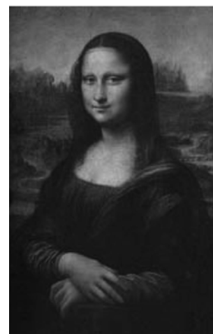
Figure 3 Leonardo Da Vinci: Mona Liza. About 1502 A.D. Paris, Louvre (E. H. Gombrich).