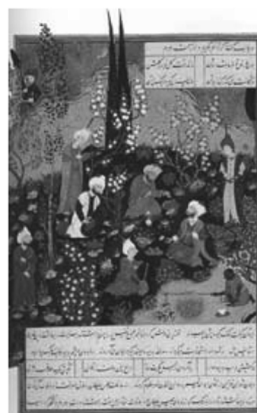
Figure 8 Firdowsi Encounters the Court Poets of Gazna' Attributed to Bihzad; from Shah Tahmasep's Shah namah, 1525 A.D.; f. 7r, C. 20 x 14cm .Collection of Prince Sadruddin Aga Khan, Geneva, nM 185 (E.Bahari)

these pre-determined customs are totally left aside, the King (Shah) is better identified beside the rest and expressionism and natural relationships among the court servants and guests, who are present at the King's feast, are well explained. Moreover, in the miniature, " The Construction of Palace of Khowarnaq " (1494/ 899 A.H.) (Figure 9), there is an internal relationship among the workers and masters. A dynamic coordinated visual structure has been created. This fairly dynamic and relative composition and the use of more persons in the miniature have resulted in Behzad being entitled as the "Oriental Raphael". Most of the original miniatures attributed to "Behzad" have such features. Two drawings of "Behzad" (Figure 10) and "da Vinci" (Figure 11) represent the emotional relationship among the figures.