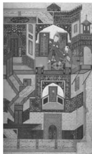
Figure 1 The seduction of Yusuf by Zulaykha’ Signed by Bihzad, from a Bustan of Sa’di, 1488; A. D. 30 x 21cm. General Egyptian Book Organization, Cairo, Adab Farsi 908.(E.Bahari)

given in this respect but is beyond the discussion of this article.