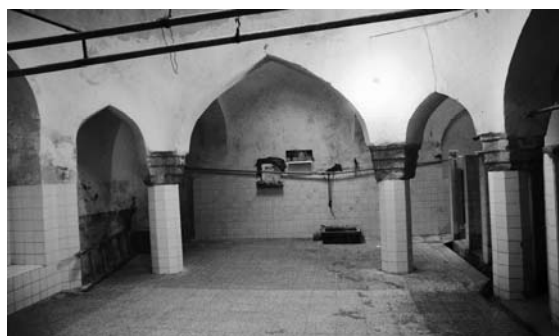
Picture 5 Small hot-house, Haj kazem bath – In Qajar period, the change of the function of water reservoir made the dimensions of the hot-houses smaller.