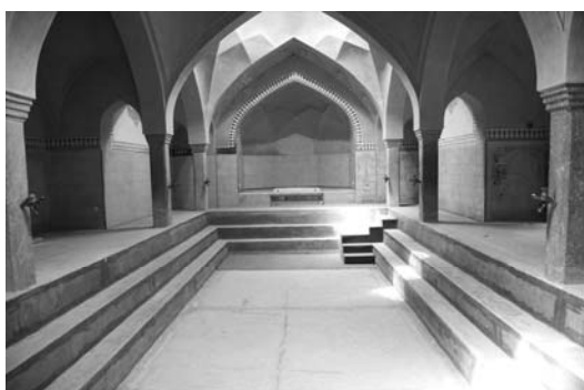
Picture 3 Pool (chal howz), Al-Gholi-Agha bath – subsidiary space which was used for swimming during the summer.