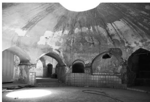
Picture 4 The large hot-house, Sheykh Bahaei bath.