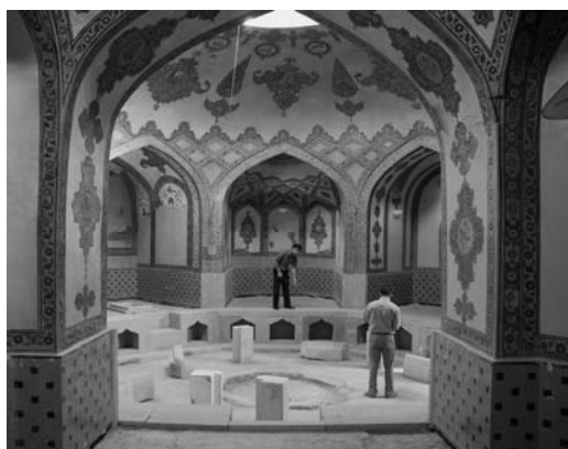
Picture 2 Sarbinā, Shah Ali bath – In this Sarbinā, stillness is in the lateral rooms and movement is in the center.