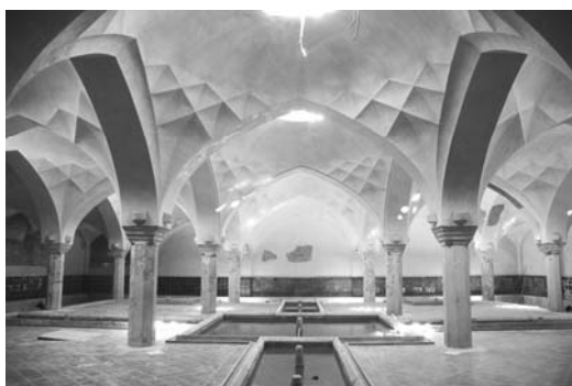
Picture 1 The central Sarbinā, Rehnan bath – In this Sarbinā, stillness is in the center and movement is constructed in the lateral areas.