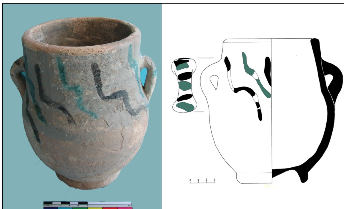
Figure 8. Typical IIIB Pottery of Sultān Abād, Discovered at Zolf Abād in Farahan.