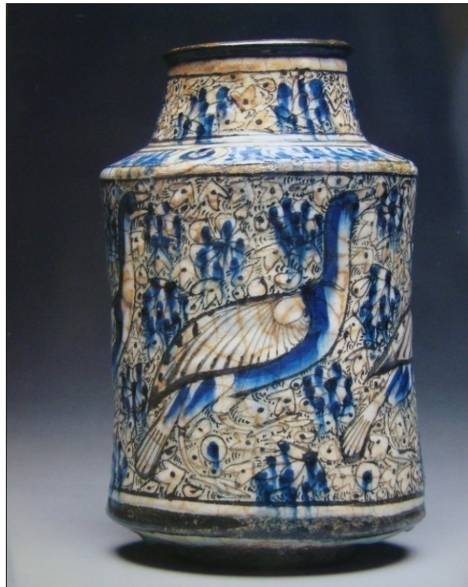
Figure 1. Pottery Type of Sultān Abād with Cylindrical Albarellow Shape.