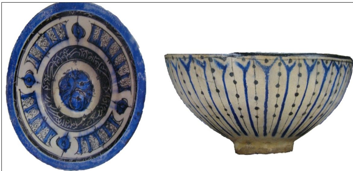
Figure 4. Style IIIA Pottery of Sultān Abād (also known as Kāshān Style).