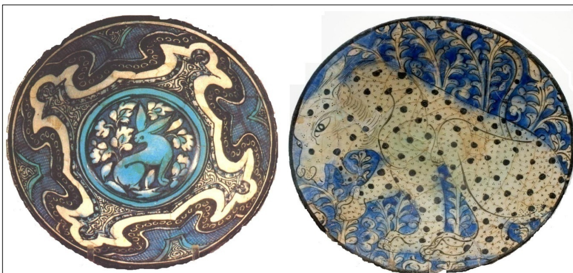
Figure 2. Style I Pottery of Sultān Abād.