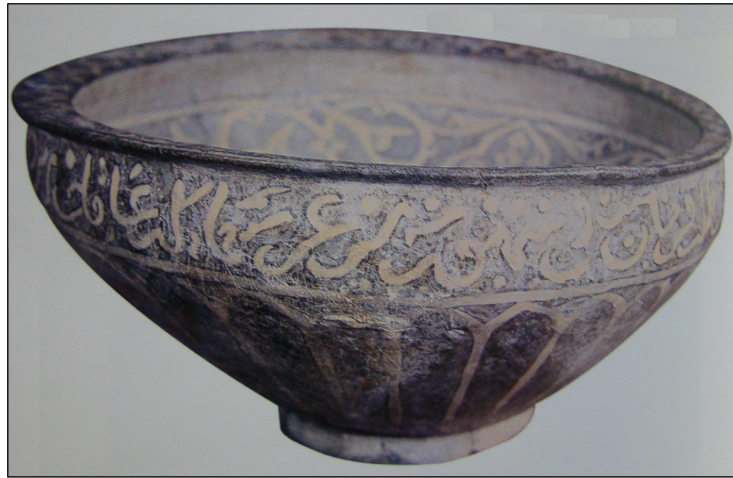
Figure 11. The Sultān Abād Pottery Type Dated 617AH (Fehervari, 2000).