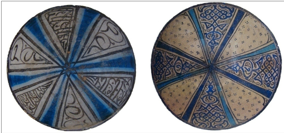
Figure 5. IIIB Style Pottery of Sultān Abād.