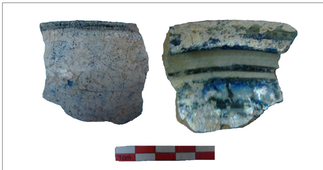
Figure 10. Sample Sultān Abād Pottery, Discovered at Tehran Plain.