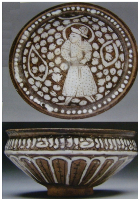
Figure 6. Sultān Abād II Style Pottery Showing Mongolian Man with Turban (Watson, 2004: 383).