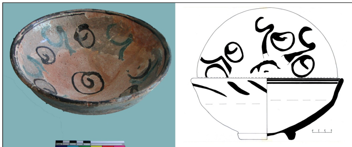
Figure 9. Typical Pottery of IIIB Group of Sultān Abād (b), Discovered at Zolf Abād of Farahan.