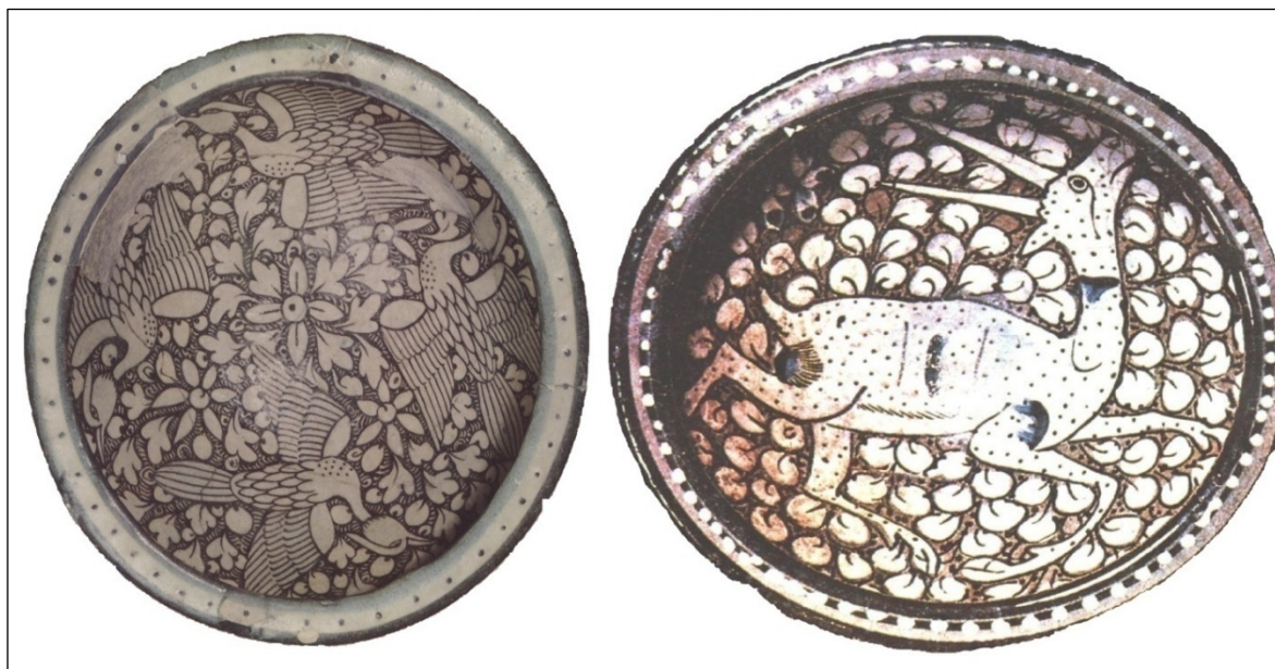
Figure 3. Style II Pottery of Sultān Abād.