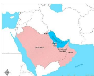
Figure (3): Map of the PGCC Countries and Indian Ocean

significant increase in the future, so this strategy may no longer be very reliable (Callen et al., 2014: 6). The importance of increasing exports as an engine for economic growth has long been the subject of considerable interest in the economic development and growth literature. The economic growth is an important index for raising the standard of living and increasing the per capita GDP in a country. Export promotion would be considered as a strategy that enables an economy to grow (Dizaji et al. 2014, 46-47). The table (1) shows the gross domestic status of the Persian Gulf Cooperation Council.