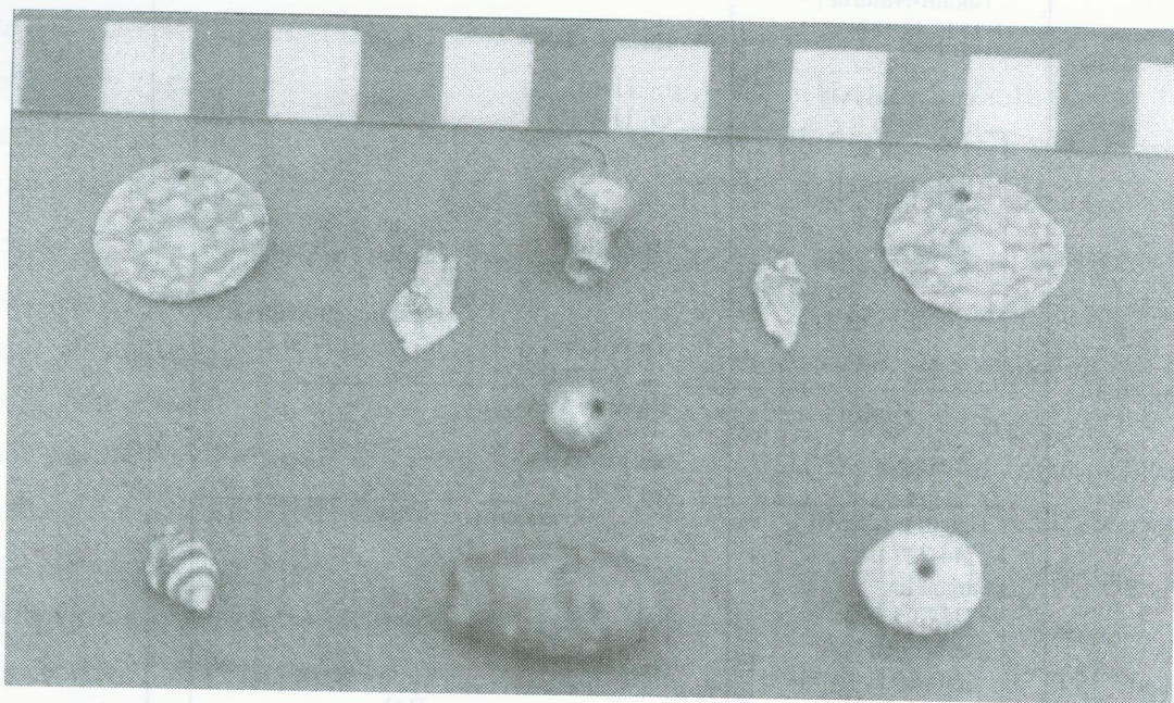
Figure 3 Nine beads left on Hasanlu BBV, six of them are gold.

excavation of 1379, shows the probability of this structure being the place of worship. These beads were left on the altar in the middle of the pillared hall of the building which Dyson considered "fire altar" (Dyson, 1989: 114, Figure 9). This shows that the altar was constructed in the temple as "gift altar" that goes to the Ubaid culture in the prehistoric Mesopotamia (Frankfort, 1969: 2).