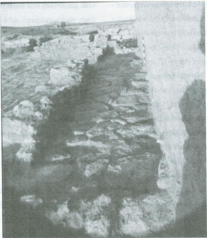
Figure 5 Architectural remains excavated at 1380.

Regarding Hasanlu I, we can only say that outwardly no sign from this is present today on the surface of the site and according to the last information published has been related to Ilkhanid period (Danti, 2002).