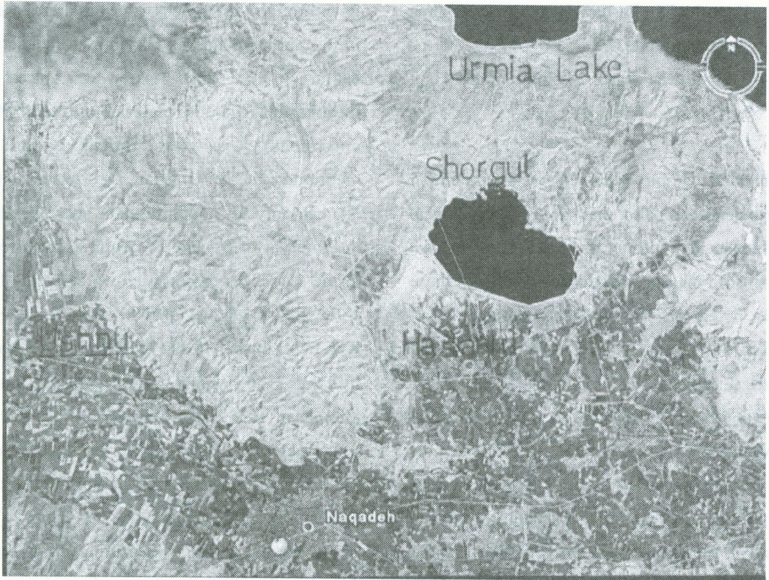
Figure 1 Situation of Hasanlu in the Solduz and Ushnu plains

Hasanlu Tepe from the very early times i.e. Neolithic period (famous as Hajji Firuz Culture) or perhaps even before, the instances of settlement have been traced, which cannot be excavated due to the elevation of the water level below the surface and in the upper layer of that settlement the traces of Ilkhanid period have been seen. Dyson has recorded the settlement at Hasanlu after the excavations (Dyson, 1983: xxvii) in the following sequence: