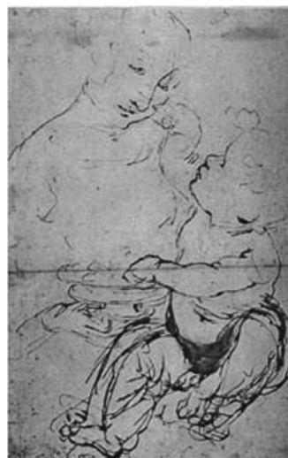
Figure 11 Leonardo Da Vinci: A part of da Vinci's drawing (relationship among the figures) The work is Typical of the Florentine Quattrocento and sir Kenneth Clark dates it a Dish of Fruit to the Child (pen, 330 x 250mm) Paris, Louvre.

Among Leonardo da Vinci's creations in addition to the wall painting of " The Last Supper ", in which the relationship among the Apostles is portrayed another is oil painting, " Virgin of the Rocks " (1485/890 A.H.) (Figure 12), containing the same features. The delicate relationship among the mother, the child and other characters is obviously felt. The pyramidal composition and the people's gathering in one place as well as their relationship, the omission of circumference lines and the use of fades are all characteristics of Leonardo da Vinci. "This is Leonardo's famous invention which the Italians call " sfumato "- the blurred outline and mellowed colours that allow one form to merge with another and always leave something to our imagination 15 ." In this painting, there is nothing viewed of the sacred circles above Virgin and Christ to identify them from the other people. This phenomenon creates a special