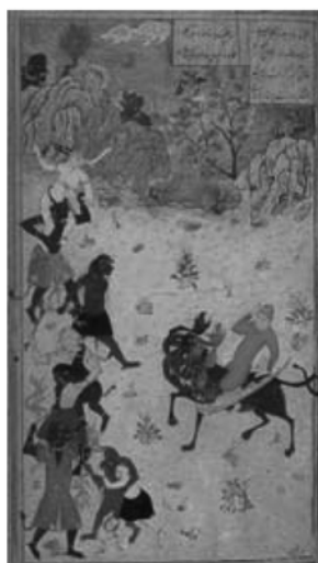
Figure 13 Mahan and the Demons' Attributed to Bihzad, from Khamsah of Nizami, 1490 A.D.; f. 188r, C. 15 x 10cm. BL, Add. 25900.

Such unusual drawings and extraordinary portraits require powerful imagination and skillful hand. In this respect, his miniature, Mahan and the Demons ' "Khamseh Nizami" (1490/ 900 A.H.) (Figure 13), where he portrayed the story of Mahan and demons can be referred. In these paintings, he displayed the demons with human-like bodies and animal-like heads. There are also some drawings by Leonardo da Vinci, like "Grotesque or Caricature" (Figure 14), where he changed the faces into an extraordinary form. Leonardo's power of imagination had been capable of deforming and totally changing the faces and figures. This also indicates that there might have been people with strange faces, from which these paintings and unusual drawings are derived for instance the portrait "Dervish" (Figure 7). Behzad and da Vinci have had a special interest in creating unusual and extraordinary figures and images.