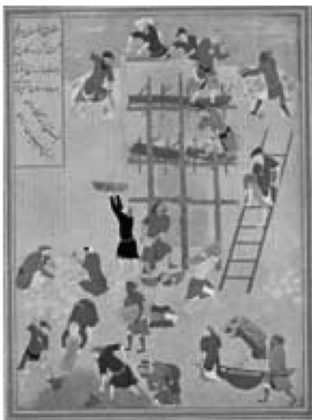
Figure 9 The Construction of the Palace Khovarnaq by Bihzad, from Khamsah of Nizami, 1494 A.D.; 20 x 14cm. BL, Or 6810.