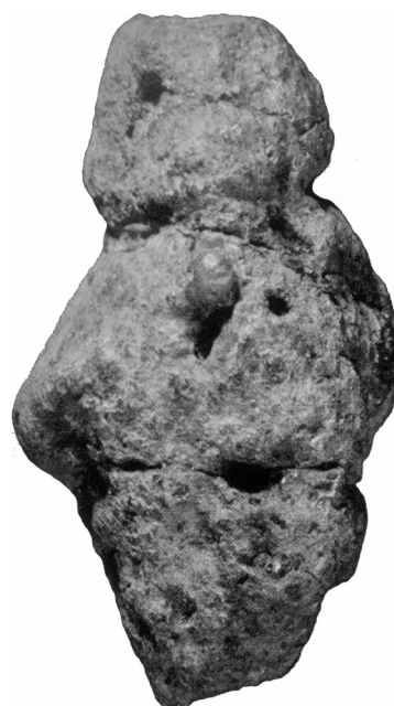
Figure 4. Bekharat Ram figure, purported to be a deliberate female form. The incisions are consistent with an anthropogenic origin, but the meaning of the final product has been subject to debate.

Unlike the Ukrainian pieces, the Bekharat Ram (Figure 4) figure has received credibility from scientific scrutiny. Excavated from the Golan Heights in the early 1980s, this “plum-size” piece of volcanic tuff gained notoriety when archaeologist Goren-Inbar observed that its incisions resemble a woman. According to Goren-Inbar, an early human saw the suggestion of a female form within the pebble’s natural cracks and then embellished them into a