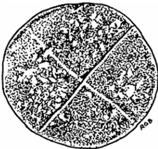
Figure 2. Silicified nummulite from Tata with a natural crack bisected by an engraved line (image from Bednarik 1995: 613)

distribution between the incisions and the object's borders.