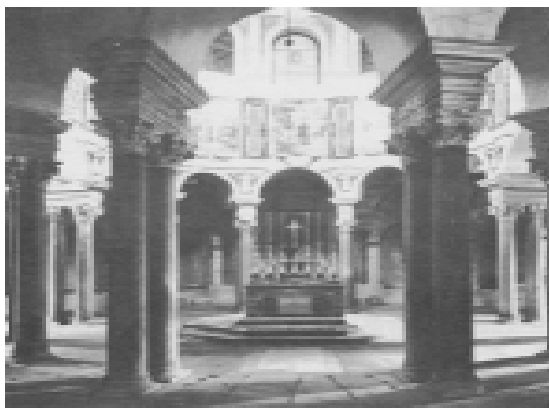
Fig 4. Santa Costanza

too, was situated over a circular mass with an internal ambulatory. There included a vestibule before the main space which has ruined. The ambulatory was a semi-dark space with a high window.