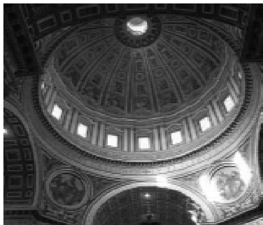
Fig 8. St. Pietro

An over-scaled, convex -concave "billboard" surmounted by a huge oval niche, proclaims it to be a small church. On its roof, a domed lantern is paired with a columned tower, twisted at forty-five degrees to inflect toward this important crossroad.