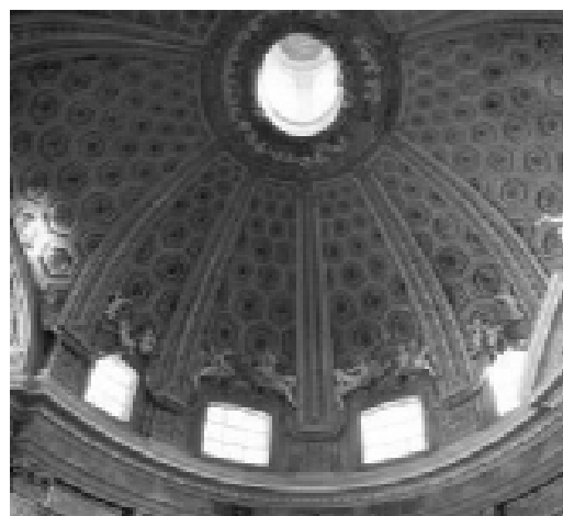
Fig 7. St. Andrea

dramatic shadows and illuminating the opposite wall with an ethereal glow.