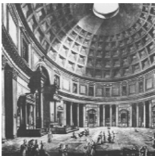
Fig 2. Interior Pantheon

Pantheon, which was rebuilt during the 2nd century after consecutive fires, hosts the light under its great dome in the forms of daylight and sunlight. Both literal and metaphorical use of lighting presents the sense of space together with the divine beauty (Semes, 2005:54). The daylight diffuses gently in the interior space while the sunlight falls directly from the oculus and moves whole day on the coffers of the inner dome surface. These two contrary movements transform the sunlight and the daylight from natural to spiritual ones. Visitors perceive these natural lights once they stand beneath the oculus. In other words, the sunlight gives visitors the feeling of the power of nature or they perceive the divinity via daylight.