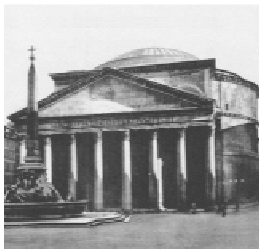
Fig 3. Exterior of Pantheon

Pantheon, which was rebuilt during the 2nd century after consecutive fires, hosts the light under its great dome in the forms of daylight and sunlight. Both literal and metaphorical use of lighting presents the sense of space together with the divine beauty (Semes, 2005:54). The daylight diffuses gently in the interior space while the sunlight falls directly from the oculus and moves whole day on the coffers of the inner dome surface. These two contrary movements transform the sunlight and the daylight from natural to spiritual ones. Visitors perceive these natural lights once they stand beneath the oculus. In other words, the sunlight gives visitors the feeling of the power of nature or they perceive the divinity via daylight.