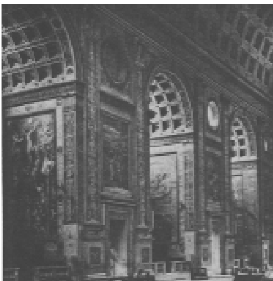
Fig 5. Interior of Hagia Sophia

Visitors are amazed with the light of Hagia Sophia to the extent that it gives them impression of coming from God's heaven onto heaven on earth. The perfection of Byzantine churches which was carrying one's sight upwards towards the central dome (Wixom, 1997:23), reached to their culmination in Hagia Sophia that was unique of its kind (Cormack, 1998:98). The daylight reflecting from the golden mosaics was taken as a solution for illuminating the interior space (Ertug, 1992:7) and could be evaluated as supporting the gloomy level of overwhelming spiritual light.