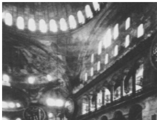
Fig 6. St. Andrea Church

Renaissance could transform the spiritual spaces of middle ages by invoking solid and geometrical designs. Instead of changing the world a calm place under God's command, the Renaissance made humanism as the main axis. Circular plan became the symbol of controlling dynamic energy in axis and organizing space.