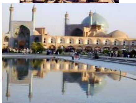
Figs 5& 6 Views of Naghsh-e-Jahan square which shows interesting design with various activities as unique example of a traditional safe and secure city. (Ref: http://www.hamshahrionline.ir/imagesupload/newspose8607bazar1-zr.jpg.jpg )

Bazaar with business activities is as an important urban heart. These activities, encourage “people use the pathways” which “Jacobs” (1961) expresses as a requirement to the defensible space. Also “Angel” in his researches mentions that crime rate is related with activity scale in streets. So, felling of ownership in Naghsh-e-Jahan among shop owners which have surrounded the spaces around would lessen social responsibility. In other words, dominant social surveillance decreases crime situation and increase environmental security. Pettersson also emphasizes on “diversity of use in quarter” in order to reducing of crimes opportunity through increasing people presence (Pettersson, 1997: 179-202) and kinds of activities.