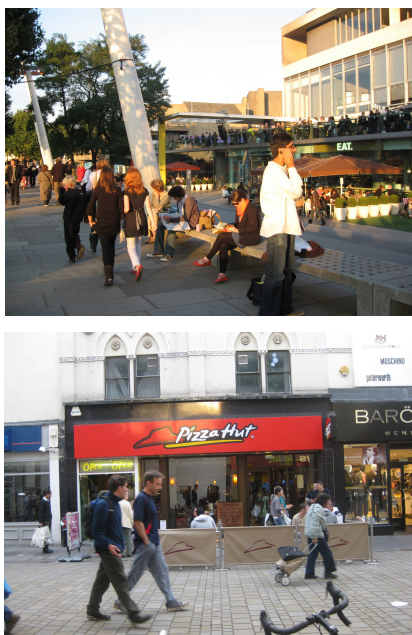
Figs 1& 2 Increasing activity rate in street and urban public spaces, with supporting social capacity concept, encouraging passengers use and reduce of crime rate sensibility. (Ref: Rezaeifar)

In fact CPTED approach, (NICP, 2005) follows specific guidelines for reducing urban crimes (Gronland, 2000), which have paid them from preventing crime center as bellow (Pourjafar et al., 2008: 78):