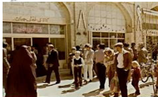
Figs 4& 5 Bazaar path and business activities beside diversity uses; recreational, religious, tourism,... around the square, give square possibility for natural surveillance and continues guarding in the old and valuable of Safavid bazaar through encouraging citizens and tourists presence.

Study on Naghsh-e-Jahan with emphasis on defensibility and environmental security of urban spaces confirm exploiting of defensible principles. One of these principles which have regarded in this historical square is diversity and efficient mix of planned uses around the square (Fig. 4, 5).