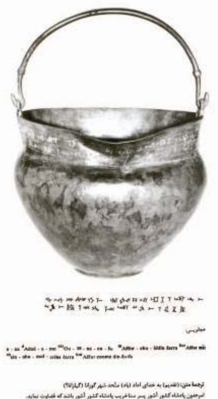
Figure1 Kalmakarra silver bucket with Neo-Assyrian inscription.

together in Cham-Mehr, south west of Pol-e Dokhtar and close to the present Darreh-šahr and came to be known as “Seymareh” (Izadpanāh 1997:46).