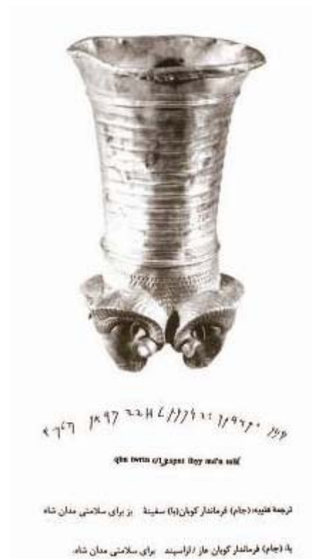
Figure 2 Kalmakarra silver rython with Old Aramaic inscription.

within the territory of Scythians today called as “Kuban” or “Taman Peninsula;