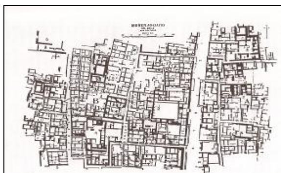
Fig.2. Plan of houses and streets, Mohenjo-daro (Wheeler 1997:48).

In any case, there are still no sufficient evidence and reasons for understanding the absolute causes of the change and transformation of the ancient or primitive form into the advanced form in the Indus Basin (Fig.2), though a group strives to find out the answer to this important question in other places and beyond the Indus Basin. But it should be admitted that it is a commercial idea and a futile attempt. Based on available evidence in the Indian Sub-continent museums such as the National Museum of India (New Delhi), the Indus Valley had been the place where such transformation took place, and particularly when the continuance of the population, technical expertise, discoveries, writings and the administrative and social set-up is analyzed, they do vindicate the idea.