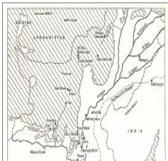
Fig.1.Map of pre-Harappan settlements (Allchin 1993:103).

In the areas of Baluchistan and present Afghanistan, on the hills and between the valleys close to the Indo-Iran borders, there existed scattered hamlets with various cultures, all of which basically possessed common special features. Some of these hamlets later transformed into urban centers. This view is supported by extant remains of original enclosures of the Pre-Harappan Civilization, particularly in Sindh, Punjab, Gujrat and North Baluchistan (Fig.1).