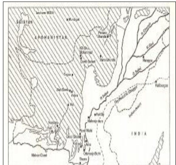
Fig.1. Map of pre-Harappan settlements (Allchin 1993:103).

In the areas of Baluchistan and present Afghanistan, on the hills and between the valleys close to the Indo-Iran borders, there existed scattered hamlets with various cultures, all of which basically possessed common special features. Some of these hamlets later transformed into urban centers. This view is supported by extant remains of original enclosures of the Pre-Harappan Civilization, particularly in Sindh, Punjab, Gujrat and North Baluchistan (Fig.1).