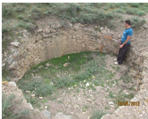
Pic 5: Water storage remains in Sixth surface of Pouläd castle

It essentially used strong and local materials as indicated from the remains. As such, like all mountainous castles, mortar and stone were used in this structure. Mortar is also used for veneer in the castle's main citadel in a way that the trace of architect's hand is observable on walls. The interesting thing is that brick has not been used in any remaining parts and all of them are right triangle, circular walls or the walls connected to a circular tower.