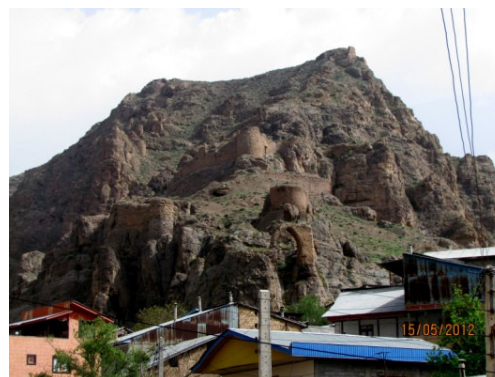
Pic 1: Pouläd Castle