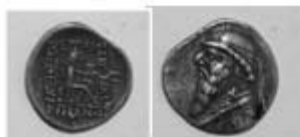
25- Mithradates I