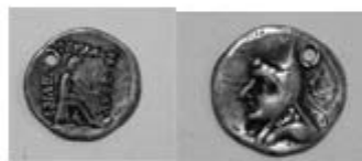
10- Mithradates I