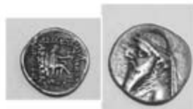
27- Mithradates I