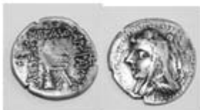
5- Mithradates I