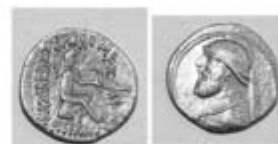
15- Mithradates I