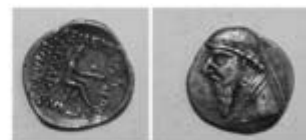
17- Mithradates i