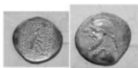
19- Mithradates I