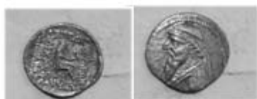
20- Mithradates I