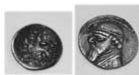
28- Mithradates I