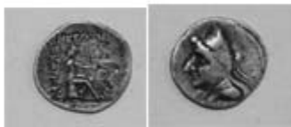
11- Mithradates I