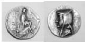
1- Arsaces II