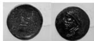
37- Artabanuse I