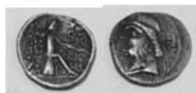
32- Phraates II