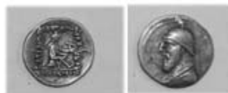
30- Mithradates I