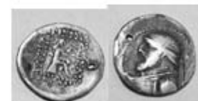
16- Mithradates I