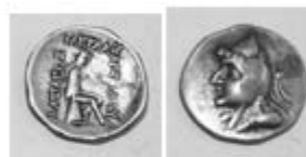
9- Mithradates I