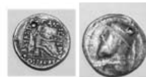
18- Mithradates I