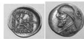
13- Mithradates I