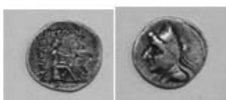
11- Mithradates I