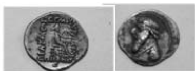
23- Mithradates I