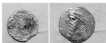
22- Mithradates I