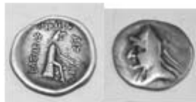
7- Mithradates I