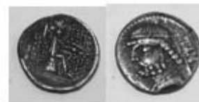
34- Phraates II