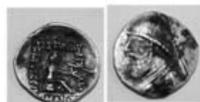
12- Mithradates I