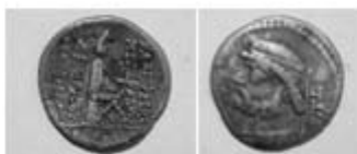
31- Phraates II