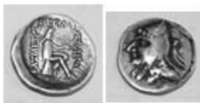
8- Mithradates I