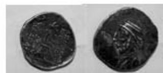
36- Artabanuse I