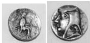
2- Arsaces II