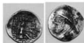
12- Mithradates I