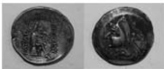
3- Mithradates I