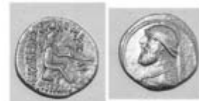
15- Mithradates I