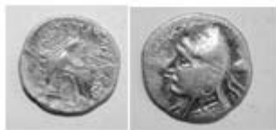
6- Mithradates I