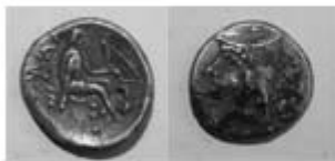
4- Mithradates I