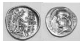
33- Phraates II