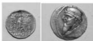
24- Mithradates I