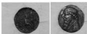
21- Mithradates I