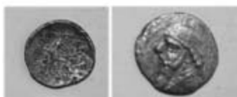
26- Mithradates I