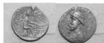
35- Artabanuse I