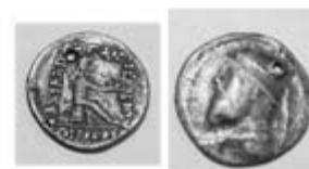
18- Mithradates I