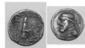
14- Mithradates I