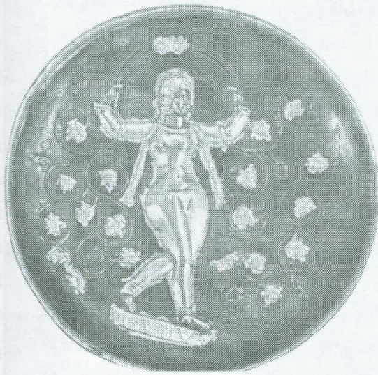
Figure 5 Silver-gilt plate showing female dancer with vegetal decoration. Cleveland Museum of Art (source: Lukonin 1971a: 181).