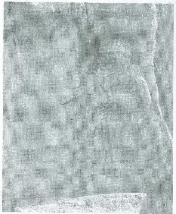
Figure 7 Investiture of Narseh, Naqsh-i-Rustam.

period, continuing through into the Sasanian period (Shepherd 1964: 82). She also mentioned that artists from the Seleucid and Parthian periods had imitated the Greeks. Their way of rendering the female figure was used as a prototype. So, the four figures depicted on the Cleveland vase, each according to the symbols, which they hold, show different characteristics or attributes of the goddess Anahita. For instance bucket and bird are her symbols as a goddess of water; vine and flower her symbols as goddess of vegetation; the dog is her symbol as guardian of home and flocks; the bowl of fruit is her symbol as goddess of agriculture; and the child and pomegranate her symbols as goddess of fertility (Shepherd 1964: 84).