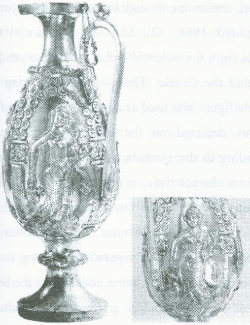
Figure 4 Silver-gilt ewer with female figure (right) holding a ewer in her hand, Metropolitan Museum of Art (source: Harper 1978: 18).