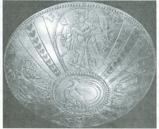
Figure 6 Silver bowl with female musician, National Museum, Tehran.

The things that women hold include either end of a shawl in each hand, with shawl forming an arch above the head (Figure 5); they are also shown while holding the hand of a small nude male child, a bird, a dog or panther and a single flower or a bunch of flowers (Figures 1, 2, 3, 4). They also sometime hold a bowl heaped with fruit (Figure 3). Considering these objects with female decoration it is said that in the reign of Shapur II, his chief priest Aturpat , by editing the text of the Avesta, “transformed the nature of the cult of Anahita, associating the goddess more closely with the worship of vegetation, of water, of flowers” (Lukonin 1971: 182).