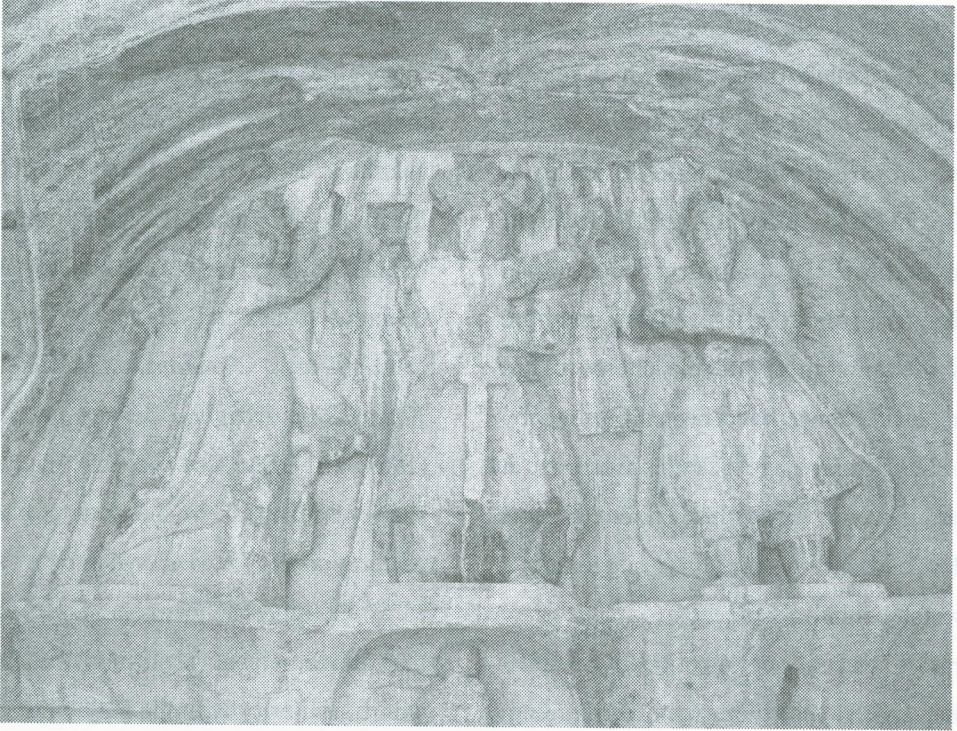
Figure 8 The investiture of Khusro II, Taq-i-Bustan.