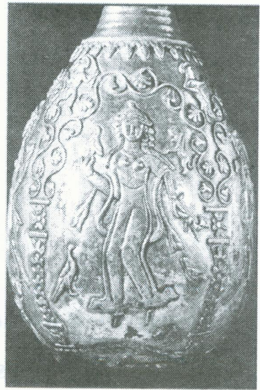
Figure 2 Silver vase showing a female holding a panther and a bird, National Museum, Tehran (source: Ghirshman 1962: fig. 256).

From the surviving objects of Sasanian silverwork, it seems that, after the royal figure depicted on the body of silver vessels, the numerous female figures, in dancing or walking pose, might be the next in terms of quantity. In addition, a small subset of female figures includes musicians playing the flute, guitar, or harp. The motifs are depicted on the body of a variety of vessels such as vases (Figures 1, 2), ewers (Figures 3, 4), plates (Figure 5), and bowls (Figure 6) with vase predominating. The exterior surface of the vessels, particularly in ewers and vases, is usually divided into two to four or six segments in the form of arched frames, each showing a female figure with number of distinctive details, often holding different objects.