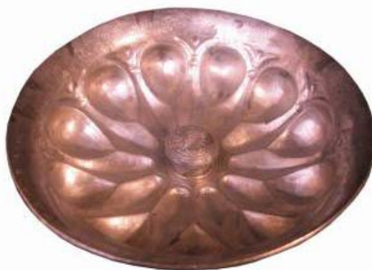
Figure 3 Kalmakarra silver under goblet with Elamite inscription.

and well protected by the heirs. Logically; it does not seem that they have made such a heritage available to the public (Bleibtreu 1999:2-5).