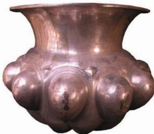
Figure 4 Kalmakarra silver goblet with Elamite inscription.

It should be said that syllable (suffix) “/– nal ” is absent. “The Samati king”, such a