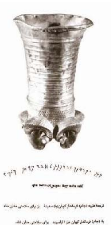
Figure 2 Kalmakarra silver rython with Old Aramaic inscription.

within the territory of Scythians today called as “Kuban” or “Taman Peninsula;