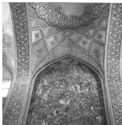
Figure 7 Shah Ismail in Battle against The Ottomans, Mural painting, Chihil Sutun palace, Isfahan, 1647-1650

In Shah Ismail's era, another type of painting emerged, characterized by and known as dervish scenes. Their subject matter surrounds the event of Karbala (Figure 8). Missionaries displayed these scenes to people in villages and the bazaar. This was done to arouse people's religious emotions and encouraged