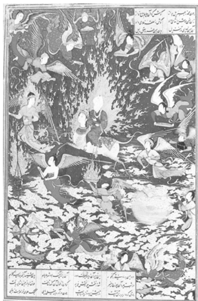
Figure 5 The Ascension of Prophet Mohammad, Khamseh Nezami, 1529-1543, The British Museum Library London

In this period, the art of painting reached its peak in the Muslim world (Figure 5). The most important painter was Kamal ed-din Behzad (Figure 6). Before that he was an artist at the Timurid Court. He relocated from Herat to Tabriz during the time of Shah Ismail (Figure 7). He was put in charge of the royal library. "It is related to Shah Ismail that, during a battle he feared to lose; so he hid the painter Behzad who was among his escort in the cave, lest that valued personage fall into the hands of the foe" (Papadopoulos, 1980, p. 25).