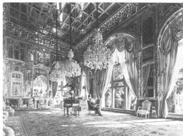
Figure 11 The Hall of Mirrors, Mohammad Ghafari (Kamal al-Molk), Tehran, 1888, Oil on Canvas, Gulistan Palace Collection

By the end of the Qajar era, Persian painting suddenly reverted to European painting in terms of theme and technique under the influence of Mohammad Ghaffari, known as Kamal Al-Molk (Figure 11). His students carried on his style through the Pahlavi era. Under the Pahlavi's, Persian painting went in the same direction as western painting (Figure 12). Under the influence of modernism, traditional and religious themes lost their power and popularity.