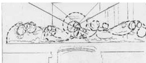
Figure 18 Spiral infrastructure in da Vinci's work [The Last Supper]