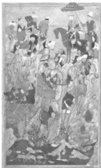
Figure 15 The Pursuit of the Kipckak Army' Attributed to Behzad, from the Zafar-namah, 1485 A.D.; ff.282v-283r, double-page illustration, each page. 20x12cm. John Work Garrett Library, Johns Hopkins University, Baltimore.

The same interest in war instruments, techniques, tactics and scenes could be found in Leonardo's works. Leonardo draws a painting from "The Battle of Anghiari" (1490/ 900 A.H.) (Figure 16A), of which there is no trace and only a reference could be made by Rubens' note of this work. Leonardo was known as a war painter. He was a military engineer and several drawings of war tools and instruments are left from him. (Figure 16B), Accordingly, Behzad, in "Zafar-Nameh" and other works such as "Bahram's Fight with Dragon" and "Battle of Leili and Majnun's Tribes", has paid much insight to real and imaginary war instruments while demonstrating war scenes.