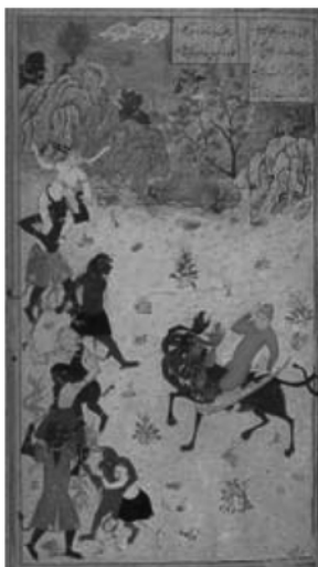
Figure 13 Mahan and the Demons' Attributed to Bihzad, from Khamsah of Nizami , 1490 A.D.; f. 188r, C. 15 x 10cm. BL, Add. 25900.

Such unusual drawings and extraordinary portraits require powerful imagination and skillful hand. In this respect, his miniature, Mahan and the Demons ' " Khamsah Nizami " (1490/ 900 A.H.) (Figure 13), where he portrayed the story of Mahan and demons can be referred. In these paintings, he displayed the demons with human-like bodies and animal-like heads. There are also some drawings by Leonardo da Vinci, like " Grotesque or Caricature " (Figure 14), where he changed the faces into an extraordinary form. Leonardo's power of imagination had been capable of deforming and totally changing the faces and figures. This also indicates that there might have been people with strange faces, from which these paintings and unusual drawings are derived for instance the portrait " Dervish " (Figure 7). Behzad and da Vinci have had a special interest in creating unusual and extraordinary figures and images.